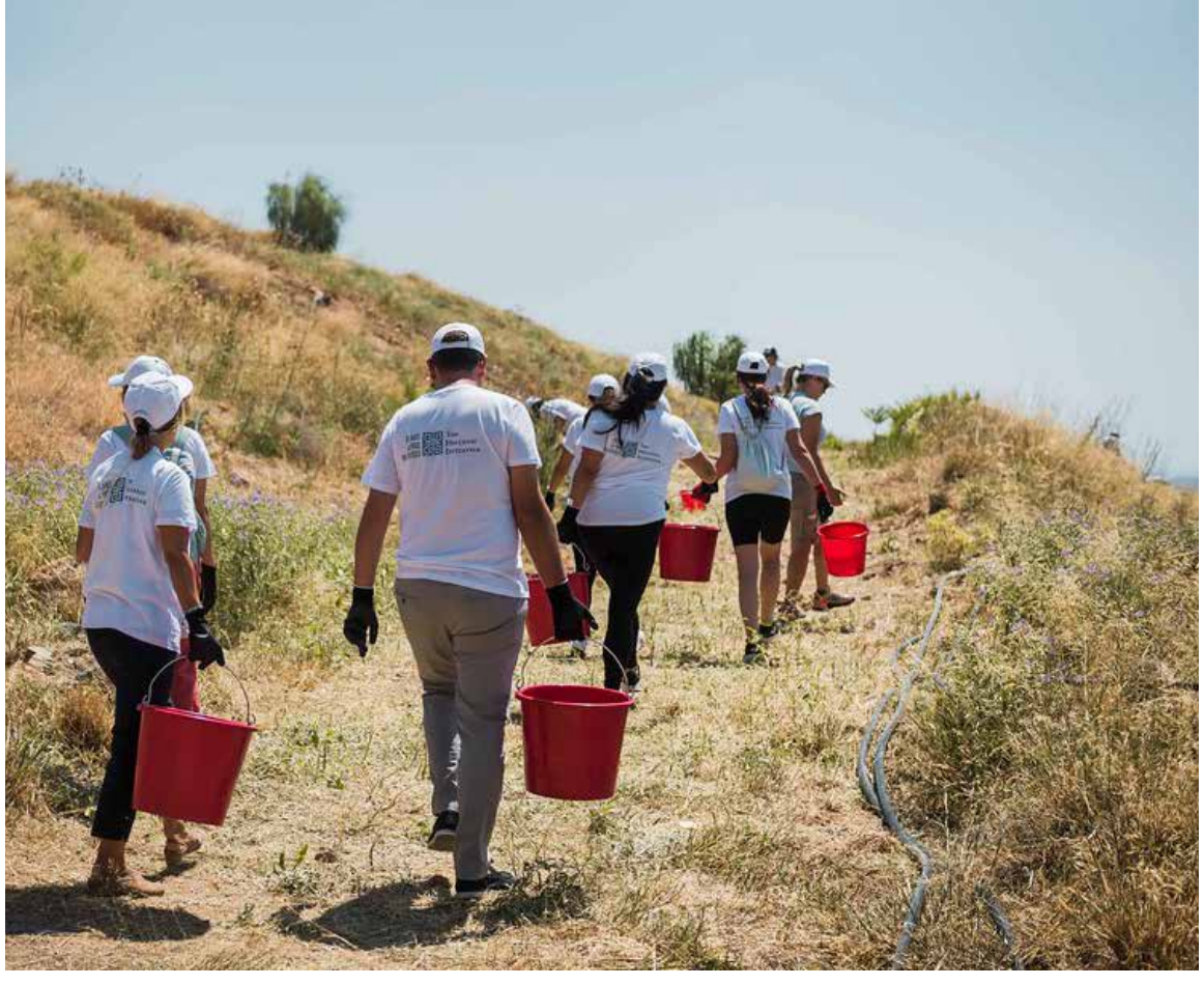
July: Athens New Leaders Plant A Tree In Greece Service Project