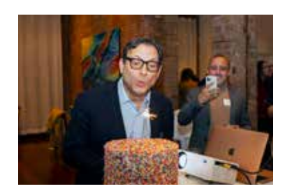
March: NYC New Leaders Happy Hour

We wrapped up this amazing year-long celebration of THI's 10 years of impact in Greece with a dynamic weekend of events in December. Our 10th Anniversary New York Gala on December brought with it a full weekend of events for our New Leaders for the first time since 2019. We spent Friday night hosting a hugely successful pre-Gala New Leaders