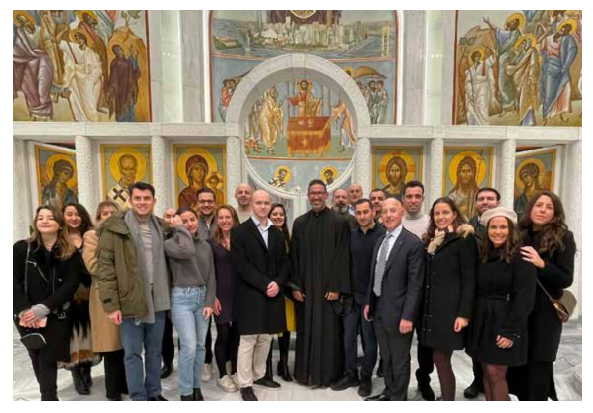
December: New Leaders visit to St. Nicholas Greek Orthodox Church and National Shrine at the World Trade Center