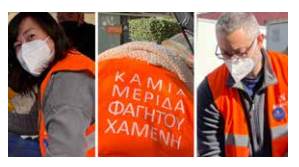
Australia's Ambassador to Greece and THI Australia CEO volunteering with Boroume.