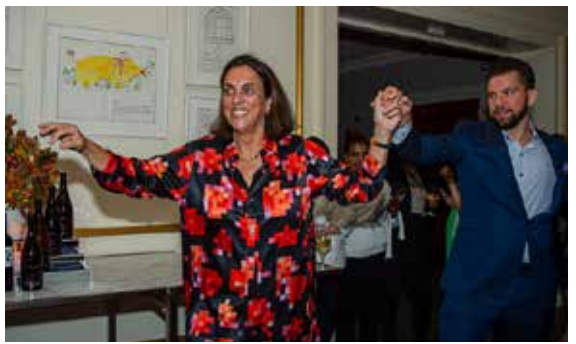
October: Boston New Leaders Cocktail Party