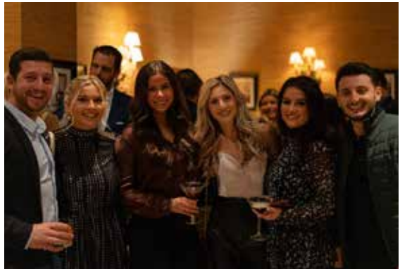
November: Philadelphia New Leaders Chapter