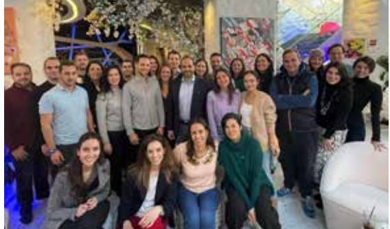
December: NYC New Leaders Pre-Gala Party and Post-Gala Brunch