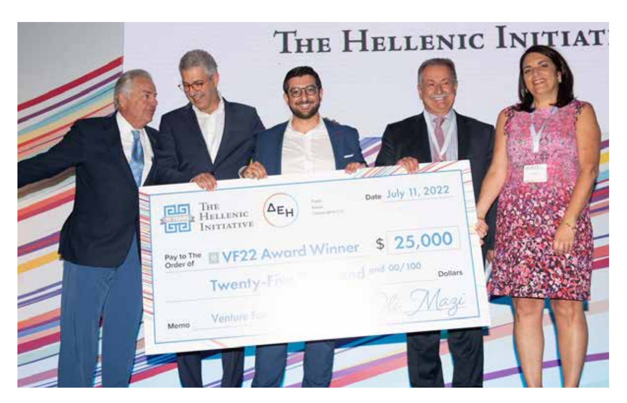
The Winning Company: Feel Therapeutics