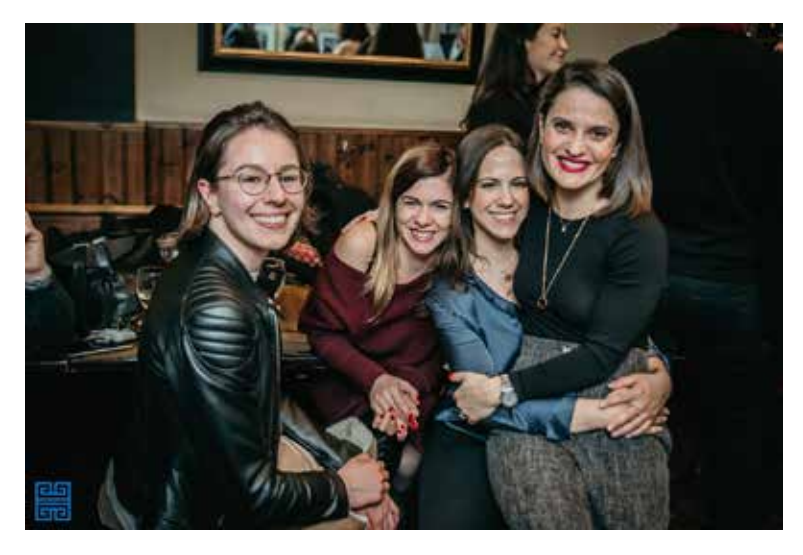
February: London New Leaders Cocktail Party

In May in San Francisco, we held an Inaugural THI Northern California Speaker Series at the St. Francis Yacht Club. The talk was on 'Hellenism and Entrepreneurship', put together and hosted by our brand new Northern California