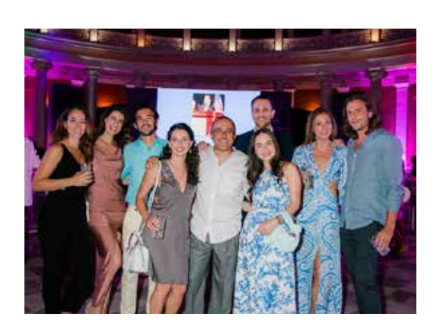
July: Athens New Leaders Zappeion Event

We saw tremendous growth in our New Leaders program in 2022, with new city chapters in San Francisco, Athens, London, Boston and Philadelphia. New Leaders are the future of our community and view THI as an important way to express their Hellenism and love of Greece, and a way to be part of a growing and vibrant Greek community, professionally and personally. 2023 is sure to bring many more New Leaders together in cities across the globe. Oli Mazi!