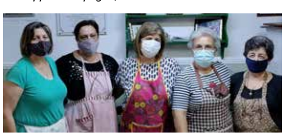
Volunteers at the Giannitsa Soup Kitchen, St. George temple, Giannitsa