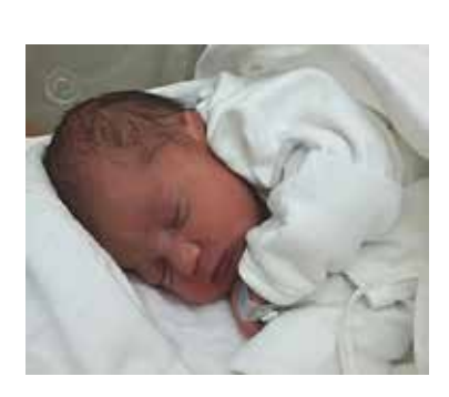
Baby Girl born on Kasos Island on October 14th, 2022, through our program with HOPEgenesis

THI Canada expanded its partnership with HOPEgenesis to include the island of Folegandros in addition to Kasos, Iraklia and Ag. Efstratios. Since the start of our program, we have welcomed 10 babies on the islands of Kasos, Iraklia, and Ag. Efstatios, areas that were threatened by the extreme birth decline rates.