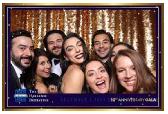
December: NYC New Leaders 10th Anniversary Gala