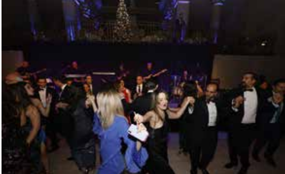
December: NYC New Leaders 10th Anniversary Gala